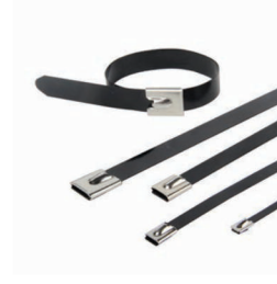
STAINLESS STEEL EPOXY COATED CABLE TIES SS304 - Ball lock type