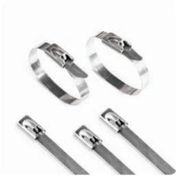
STAINLESS STEEL CABLE TIES SS304/SS316 Uncoated - Ball lock type